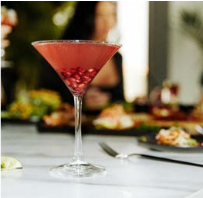
TABLE SIDE PREMIUM WINE SERVICE

PREMIUM PRICED LIQUORS ARE AVAILABLE FOR PURCHASE AND CAN BE PRICED PER BOTTLE